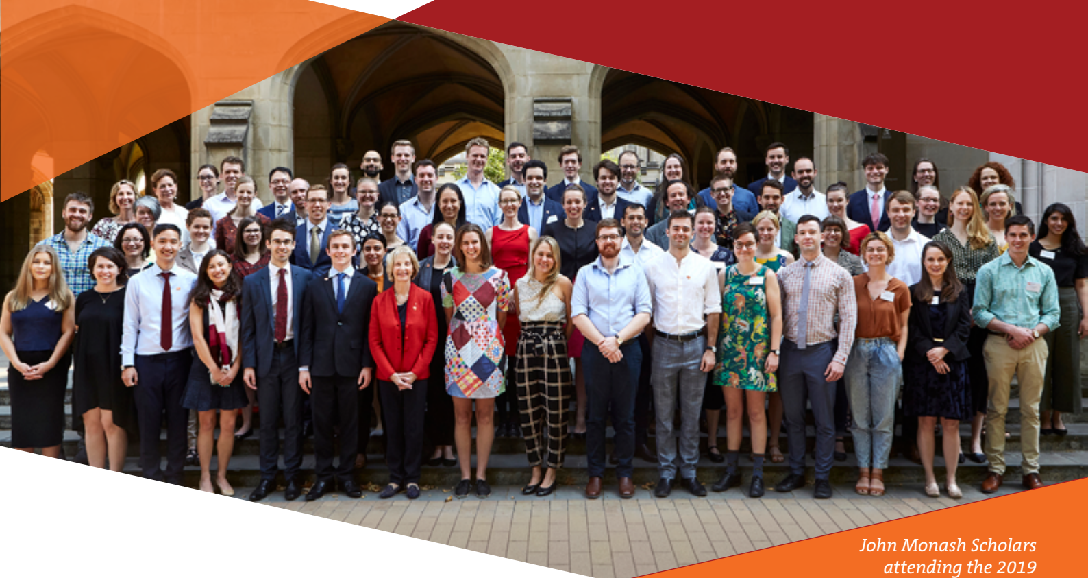
John Monash Scholars attending the 2019 Global Symposium at the University of Melbourne

Shape the future of Australia with a gift in your Will