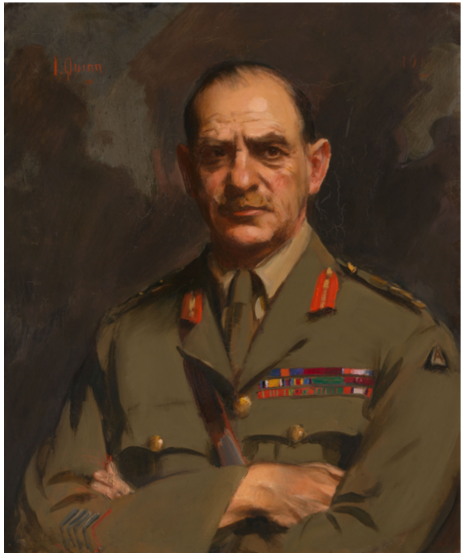
Image: John Monash, 1919