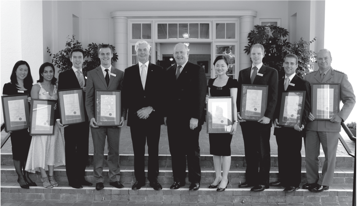
His Excellency Major General Michael Jeffery AC CVO MC (Retd) and General Peter Cosgrove AC MC (Retd) on the steps of Government House with the 2008 Award Winners after presentation of their Awards.