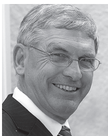
Chief Executive Officer and Company Secretary: