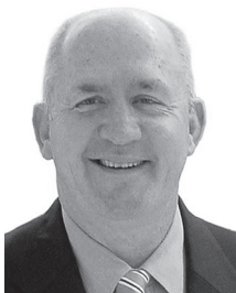
General Peter Cosgrove AC MC (Retd)

General Cosgrove is a graduate from the Royal Military College, Duntroon.